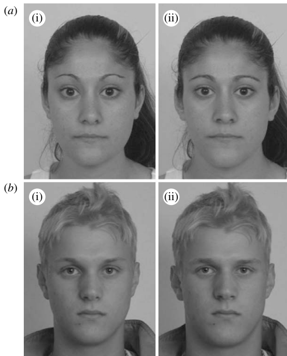
Figure 1. Examples of (a(i),b(i)) feminized and (a(ii),b(ii)) masculinized male and female faces used in our study.

age) revealed a significant main effect of sex of face ( F_{1,94}=13.05 , p<0.001 ), whereby women were more likely to choose feminine faces when judging women's faces (mean = 16.05, s.e.m. = 0.37) than when judging men's faces (mean = 11.82, s.e.m. = 0.52). There were also significant interactions between sex of face and circum-menopausal status ( F_{1,94}=4.68 , p=0.033 , figure 2) and between sex of face and participant age ( F_{1,94}=8.18 , p=0.005 ). The main effects of circum-menopausal status ( F_{1,94}=0.67 , p=0.414 ) and participant age ( F_{1,94}=2.01 , p=0.159 ) were not significant.