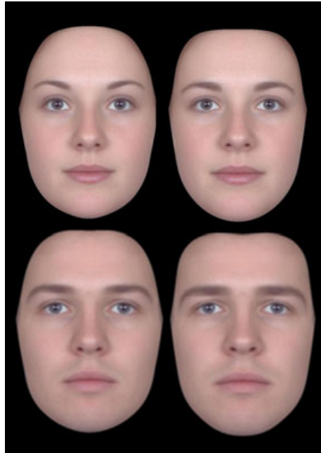
Figure 1. Examples of feminized (left) and masculinized (right) female and male faces.