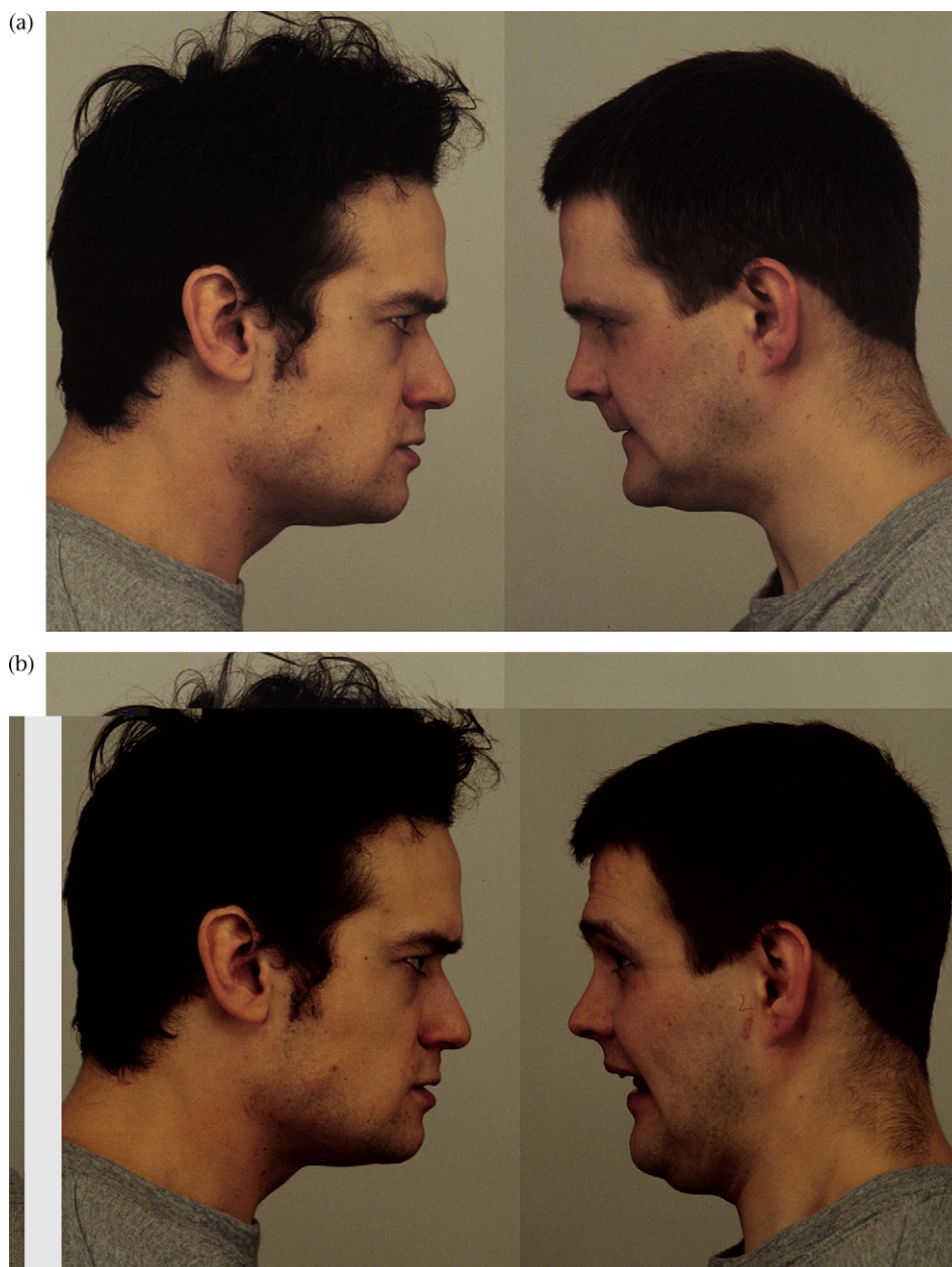
Figure 1. Examples of aggressor–responder image pairs shown in the observation phase of the experiment. The aggressor is shown in the left image and the responder in the right image of each row. (a) The responder responding to the aggressor in an aggressive manner (i.e. with an angry expression). (b) The responder responding to the aggressor in an intimidated manner (i.e. with a fearful expression).

facing each other (i.e. each pair consisted of a left-profile image and a right-profile image, see Fig. 1). Aggressor–responder pairs were presented for 4 s on each occasion. Each pair was presented twice (i.e. the observation phase lasted for 64 s in total); once where the aggressor was shown in left profile and the responder was shown in right profile and once where the aggressor was shown in right profile and the responder was shown in left profile. Showing each pair twice in this way controls for possible effects of side biases in visual attention (Uttl & Pilkenton-Taylor 2001) and/or expression processing (Burt & Perrett 1997) during the observation phase. The order in which aggressor–responder pairs were presented was fully randomized. Importantly, while the aggressors were always shown with angry expressions in the observation phase, the facial expressions of the responders were manipulated. For half of the participants, the responders paired with the Group A aggressors