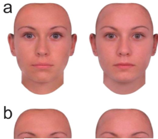
Fig. 1. Examples of paired face images used in the experiment. Images in each pair varied only in color and texture cues associated with attractiveness. Images in the left column were manipulated to be high in attractiveness, and images in the right column were manipulated to be relatively low in attractiveness. The pairs of images shown represent each of the four conditions under which attractiveness preferences were assessed: (a) direct gaze and neutral expression, (b) averted gaze and neutral expression, (c) direct gaze and smiling, (d) averted gaze and smiling.

texture information from images of six individual women (three in each composite) using established methods (see Rowland & Perrett, 1995, and Tiddeman, Perrett, & Burt, 2001, for technical details of this method; see Jones et al., 2005; Penton-Voak